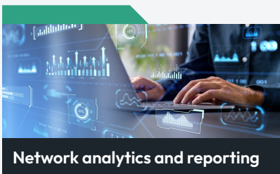
Network analytics and reporting