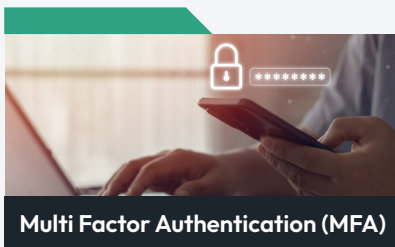
Multi Factor Authentication (MFA)