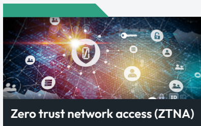
Zero trust network access (ZTNA)