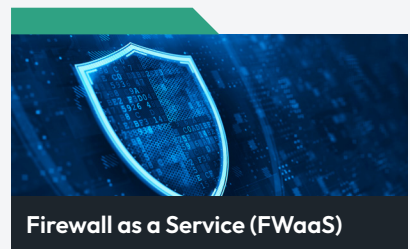
Firewall as a Service (FWaaS)