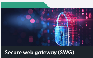
Secure web gateway (SWG)