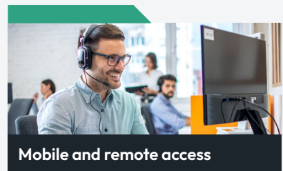
Mobile and remote access