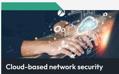
Cloud-based network security

With a unified cloud solution, housing associations can connect all data centres, branches, mobile users and cloud resources into an agile and secure global network that protects employees and tenants alike.