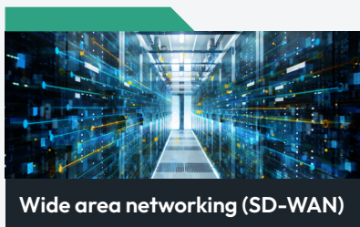
Wide area networking (SD-WAN)